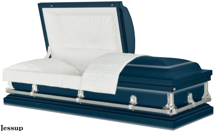
Jessup 20-Gauge Steel - Gasketed Spruce Blue Shaded Silver Finish White Crepe Interior PC: 71083033