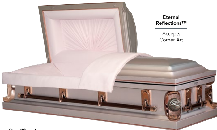
Eternal Reflections™ Accepts Corner Art