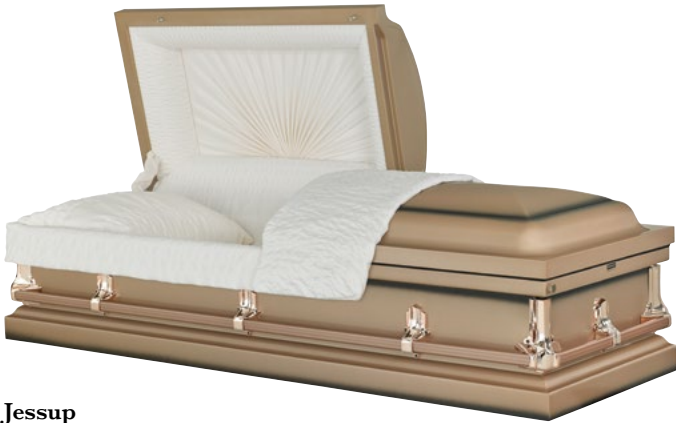
Jessup 20-Gauge Steel - Gasketed Copper/Ebony Rosetone Crepe Interior PC: 71065175