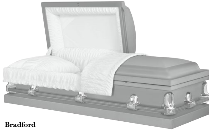
Bradford 20-Gauge Steel - Non-Gasketed Silver Finish White Crepe Interior PC: 71007289