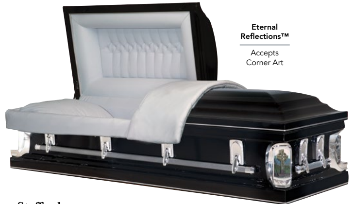
Eternal Reflections™ Accepts Corner Art