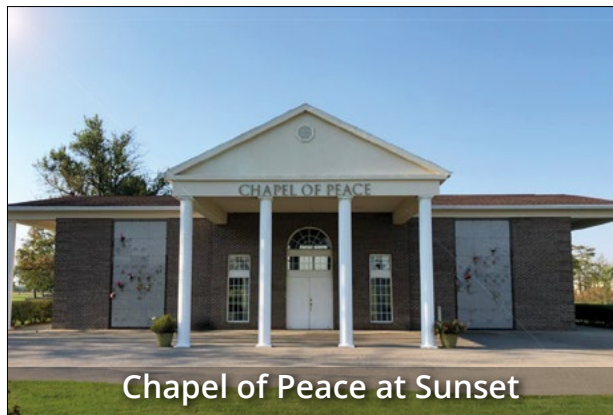
Chapel of Peace at Sunset