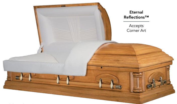
Eternal Reflections™ Accepts Corner Art