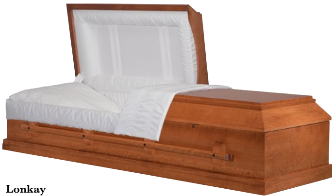
Lonkay Poplar Veneer Medium Satin Finish White Crepe Interior PC: H40080