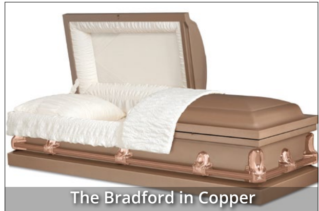
The Bradford in Copper

Monday through Friday only before 1 p.m.