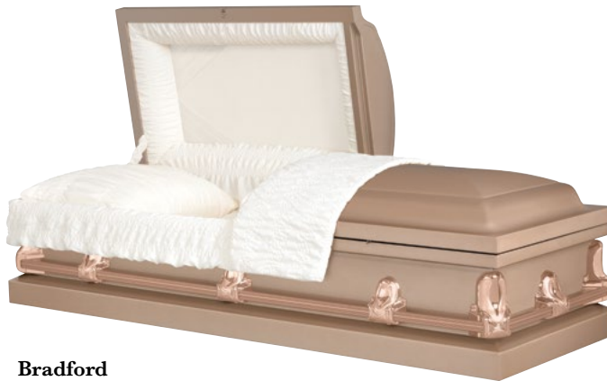
Bradford 20-Gauge Steel - Non-Gasketed Copper Finish Rosetone Crepe Interior PC: 71007290