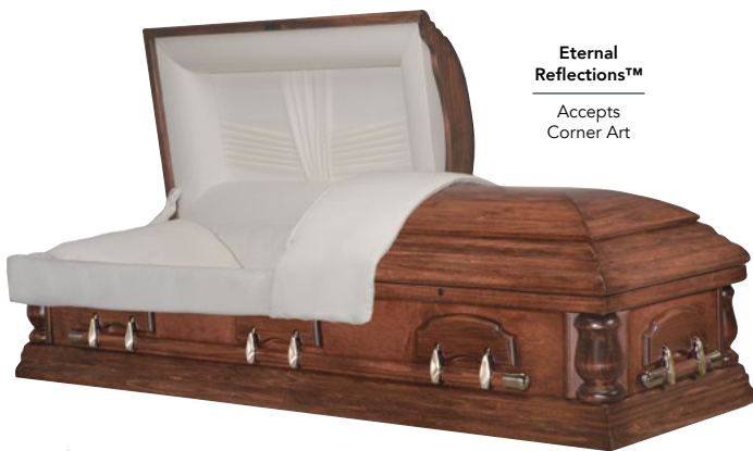
Eternal Reflections™ Accepts Corner Art