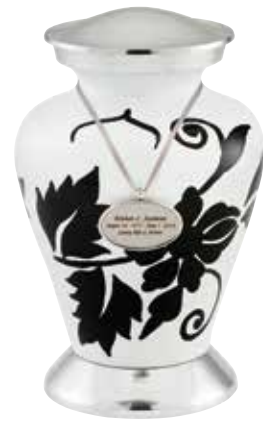
Vira Floral 3FAZ02 Aluminum urn with ebony floral display. Shown with optional charm.