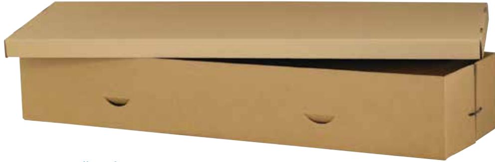
Basic Cardboard Box Plain Finish PC: 71011332