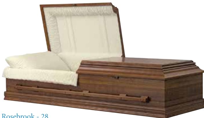
Rosebrook - 28 Carte Veneer Medium Cherry Finish Rosetan Crepe Interior PC: 70000879