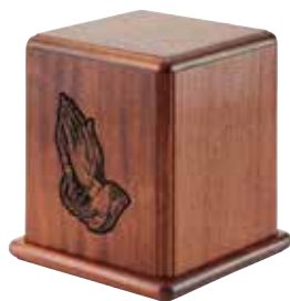
St. Joseph Z601100 Mahogany urn comes as shown with praying hands