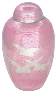
Trinitas 71216740 Brass urn with doves in flight in a pink finish