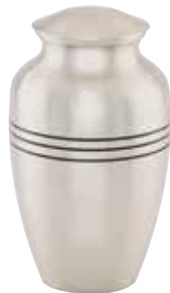
Brushed Pewter 71009854 Brass urn with brushed pewter finish