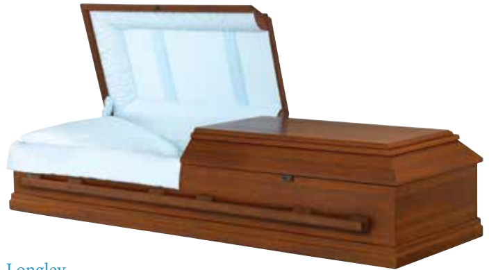
Longley Carte Veneer Medium Cherry Finish Blue Crepe Interior PC: 71013294