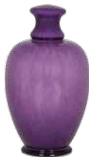
Amphora Violet 3PR303 Elegant and distinctive handblown glass urn in shades of violet