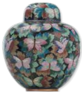
Butterfly Garden 3CL500 Enamel-over-brass cloisonné design in multi-color butterfly pattern with stand