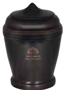
Emperor 71215620 Sophisticated copper urn shown with optional engraving