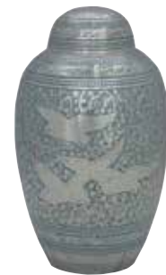
In Flight Large 71007590 Brass urn with doves in flight in a blue finish