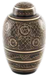
Midnight Ornate 71007614 Brass urn with unique pattern