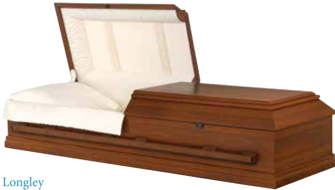
Longley Carte Veneer Medium Cherry Finish Rosetan Crepe Interior PC: 71013295