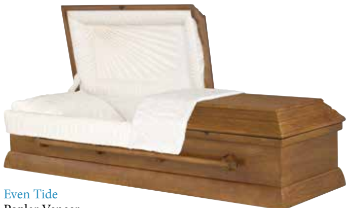
Even Tide Poplar Veneer Satin Medium Walnut Finish Rosetone Crepe Interior PC: 71009053