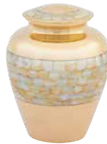
Mother of Pearl Large 71009855 Brass urn with natural mother of pearl.