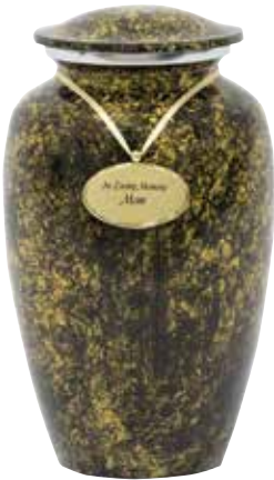
Tempo Gold 3FAZ03 Aluminum urn with motif of brown and gold. Shown with optional charm.