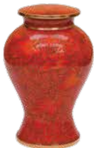
Autumn Leaves 71065356 Cloisonné urn handcrafted in warm autumn red with leaf and floral pattern