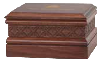
Magnolia Chest 3MAGK1 Memory chest made from solid poplar