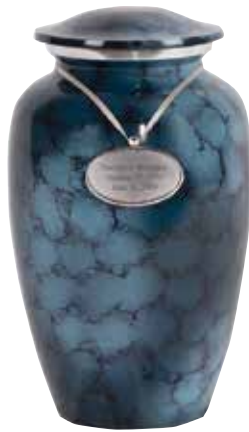
Hudson Blue 3FAZ01 Aluminum urn in shades of blue with water-color mark design. Shown with optional charm.